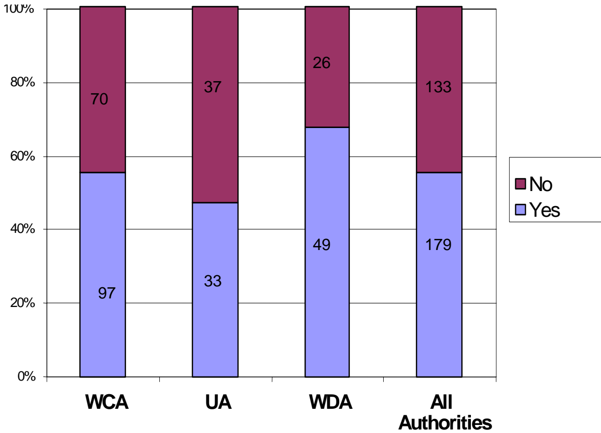
Figure 7.2: Incumbent Suppliers by authority type